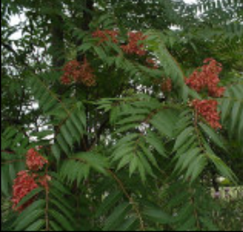
5 Tree of Heaven Ailanthus altissima