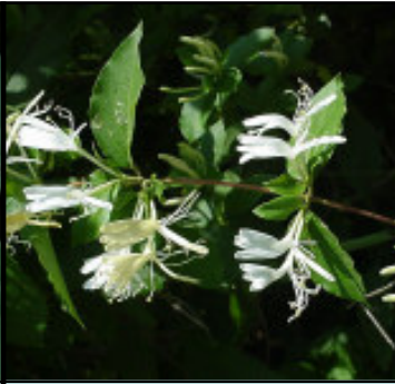
3 Morrow's Honeysuckle Lonicera morrowii