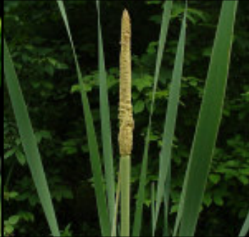
8 Narrow-leaved Cattail Typha angustifolia