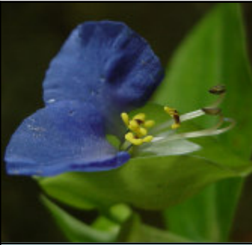
1 Asiatic Dayflower Commelina communis