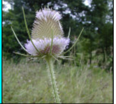
6 Teasel Dipsacus sylvestris