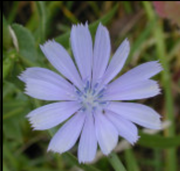
13 Chickory Cichorium intybus