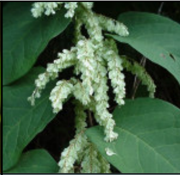
2 Japanese Knotweed Polygonum cuspidatum