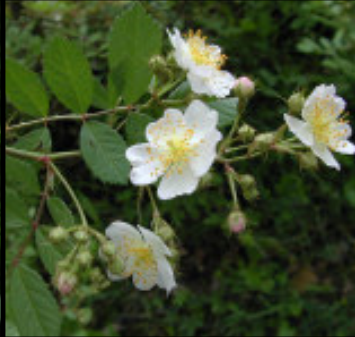
9 Multiflora Rose Rosa multiflora