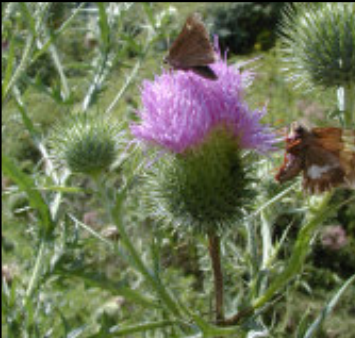
11 Bull Thistle Cirsium vulgare