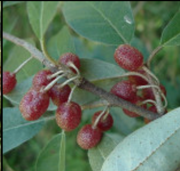
12 Autumn Olive Eleagnus umbellata