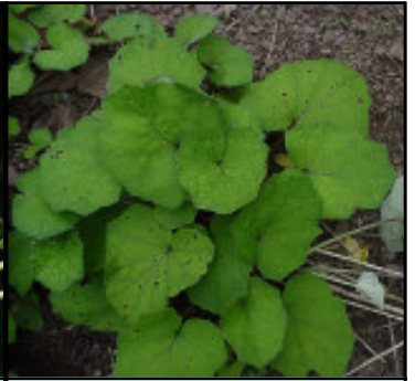
4 Coltsfoot Tussilago farfara