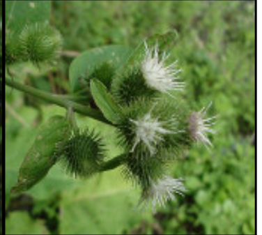
10 Common Burdock Arctium minus