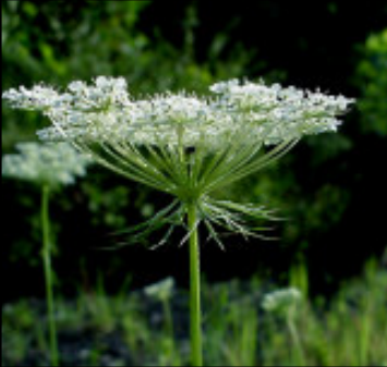
7 Queen Anne's Lace Daucus carota