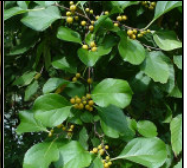
14 Asiatic Bittersweet Celastrus orbiculata